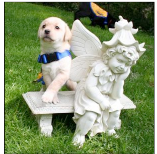
Puppy-in-training, India.